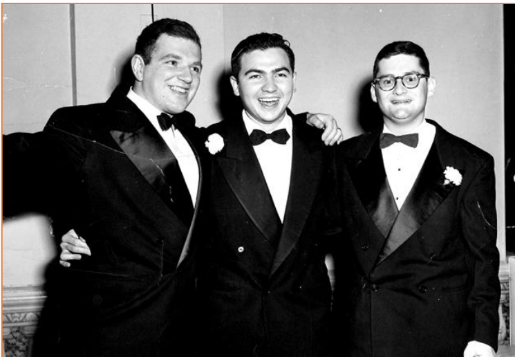
Isadore Lourie (center) with two college friends

Isadore Lourie served in the South Carolina General Assembly from 1965 until his retirement in 1993 and gained a reputation as the champion of the common man and woman. During his service in the House and Senate Lourie gained statewide recognition as the author of major legislation including the Freedom of Information Act, and bills resulting in the creation of the Commissions on Aging and the Blind and the Legislative Audit Council, exemptions of sales taxes on prescription drugs and the homestead tax, and establishment of the public kindergarten program. On his retirement, his good friend Dick Riley said—“Much of the major legislative accomplishments of the past quarter century is due to the leadership and caring of Isadore Lourie. He’s been there, with his colleagues, when vision and strength were needed.”