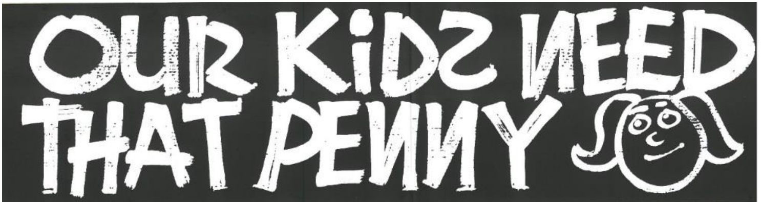
Bumper sticker in support of the EIA

Riley and his staff worked closely throughout his term—and throughout his efforts for EIA—with organizations such as the Southern Regional Education Board (SREB) and the Education Commission of the States. Beneficial to Riley's reform efforts, and to other such efforts regionally, was the 1983 report A Nation at Risk: The Imperative for Educational Reform , a landmark in American education policy. The report presented a number of recommendations similar to those found in the EIA.