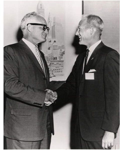
With Senator Barry Goldwater, 1962

In 1962, he switched from the Democratic Party to the Republican Party, a landmark event in a state which, typical of the South, was at that time thoroughly dominated at the state and local levels by the Democrats. In a statement about his decision, he said: "My basic convictions are being compromised by remaining in the South Carolina Democratic Party," due to "trends in this country toward a more centralized government with its utter disregard for the rights of the individual and our local governments." In making this move, Spence became the first Democratic officeholder in South Carolina to switch parties. At the same time, he announced his candidacy for the Second Congressional District seat left vacant by the death of Congressman John J. Riley. He was ultimately defeated in the race by Democrat Albert Watson, who had the backing of influential U.S. Senator Strom Thurmond. Ironically, both Thurmond and Watson became Republicans themselves within three years of the 1962 Congressional race. Spence's action in switching parties was a harbinger of things to come across the South.