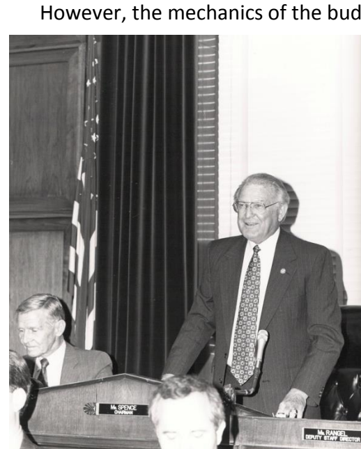
Spence takes over as chairman of the House National Security Committee in 1995.

the Republican takeover of the House of Representatives following the 1994 election. He would serve in that highly visible role for the next five years. There seemed to be the potential for a dramatic shift in Congressional leadership on military issues, especially with Spence and fellow South Carolinian Strom Thurmond holding the chairmanships of the House and Senate Armed Services Committees respectively.