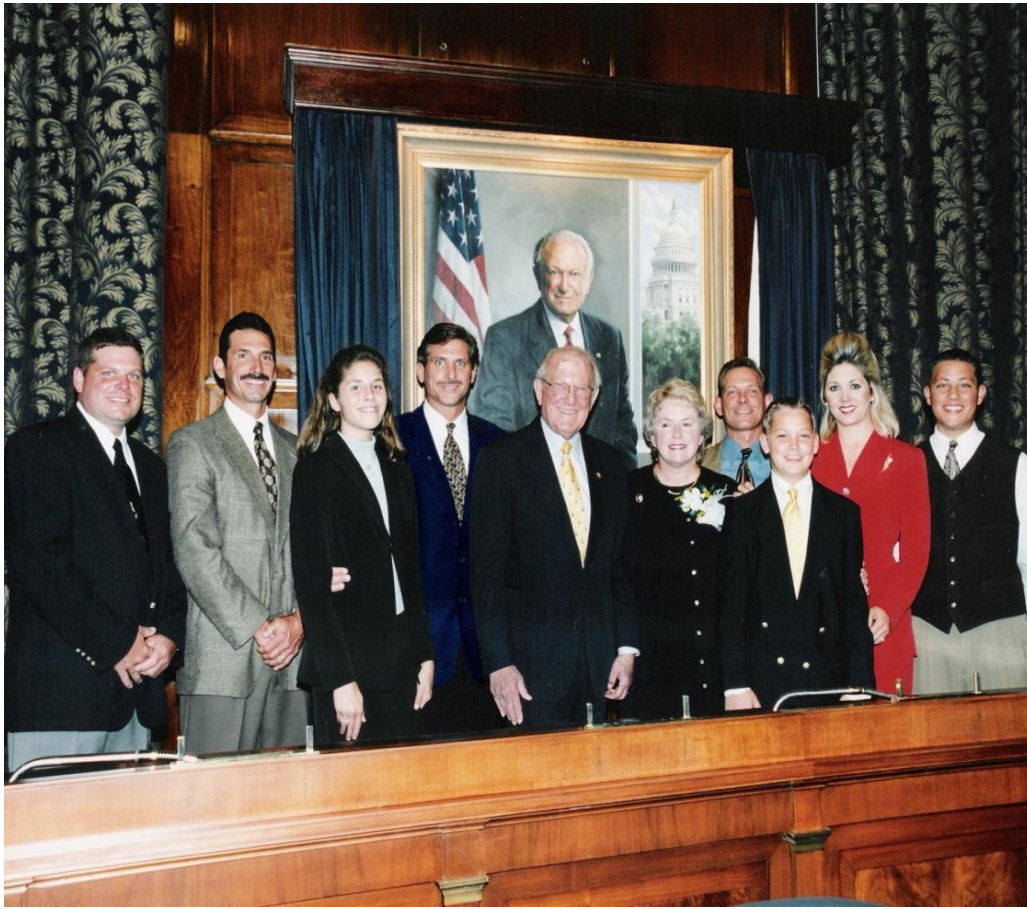
Spence and his family celebrate the placement of his portrait in the House Armed Services Committee hearing room.

Spence's casket lay in state in the State House before he was buried in Lexington. At the time of his death he was among the ten most senior Members of Congress. In the special election held to fill his vacant seat, the Second District elected Addison "Joe" Wilson, a longtime Spence protégé.