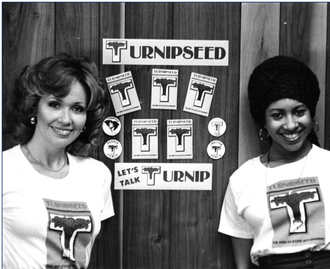
Campaigning for Turnipseed!

The records of Governors George C. and Lurleen B. Wallace can be found at the Alabama Department of Archives and History .